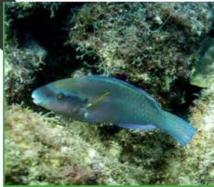
PARROT FISH PEZ LORO