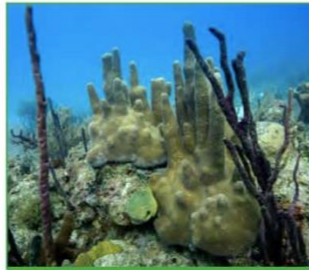
PILLAR CORAL CORAL PILAR