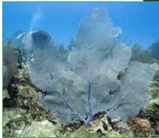
FAN CORAL CORAL ABANICO

El objetivo de este es simple—encuentra los tantos animales y plantas de la siguiente lista durante el viaje virtual y marca las casillas cuando logres verlos. Las fotos son para inspiración; los objetos pueden verse ligeramente diferentes durante el evento. ¡Buena suerte!