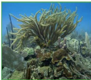
SOFT CORAL CORAL BLANDO