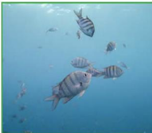
SERGEANT MAJOR FISH PEZ SARGENTO MAYOR