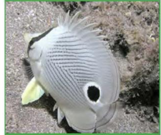
FOUR-EYE BUTTERFLY FISH PEZ MARIPOSA CUATRO OJOS