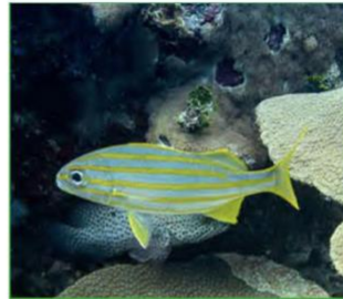
FRENCH GRUNT FISH PEZ RONCADOR