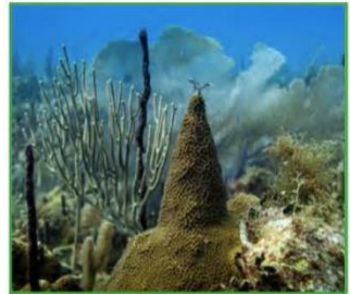
MONTASTRAEA CORAL CORAL MONTASTREA

Four-eye butterfly fish image: Aquaimages, CC BY-SA 2.5; all other images © Paul Selvaggio/TNC