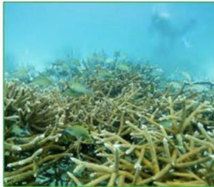
STAGHORN CORAL CORAL CUERNO DE CIERVO